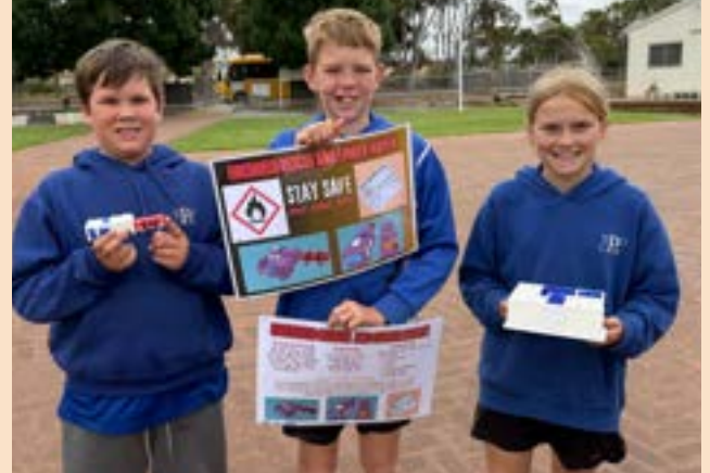
fire shield rescue & ember haven