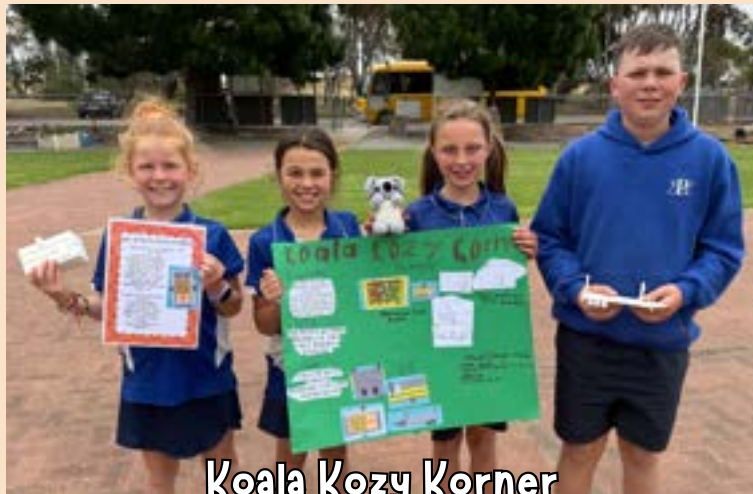
Koala Kozy Korner