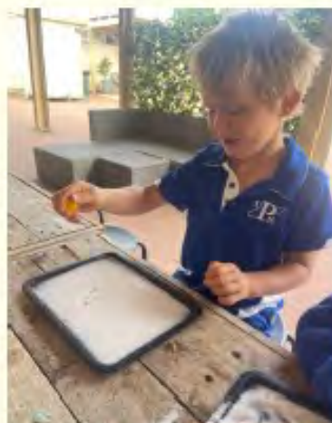
Writing the letters we have learnt