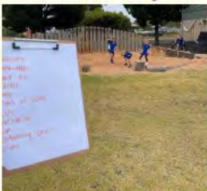
Initial sounds scavenger hunt