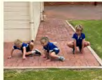
Acting out sounds