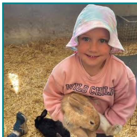
Book Week & Glen Forest fun