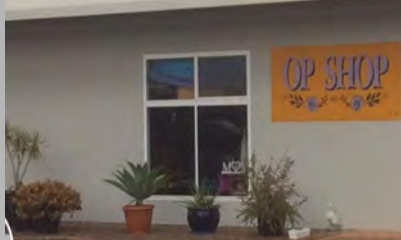
Cummins Community Op Shop