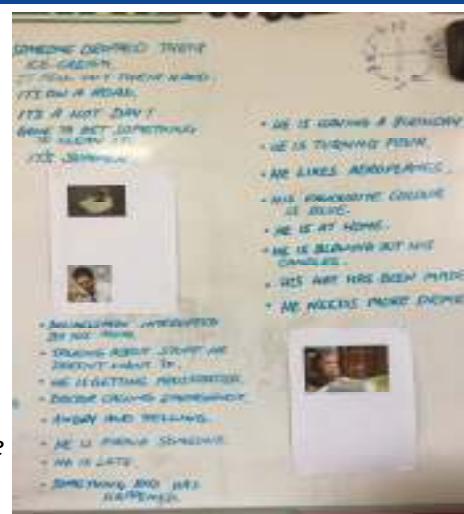
The Junior Primary Class made inferences about pictures and recorded their thinking.