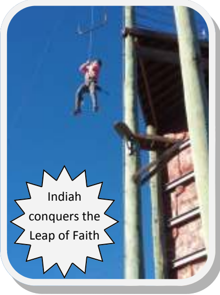
Indiah conquers the Leap of Faith