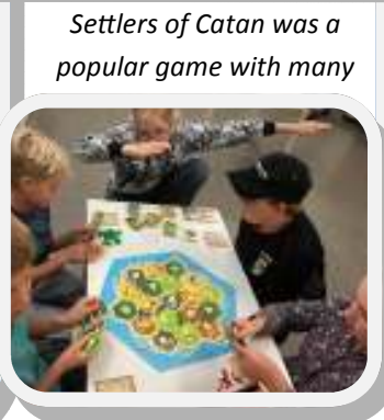
Settlers of Catan was a popular game with many