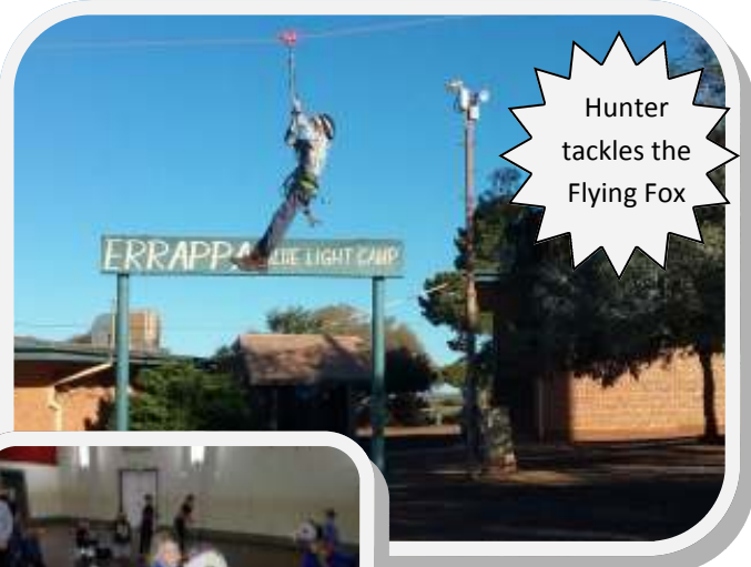
Hunter tackles the Flying Fox